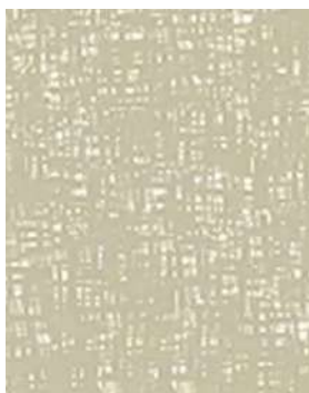
Terrace in the City