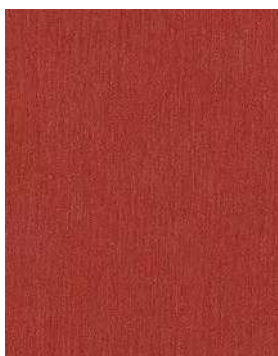
Brushed Copper Brite